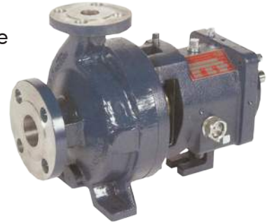
■ Griswold 811 ANSI Pump